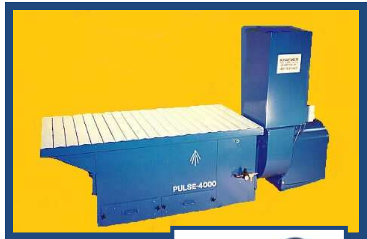
KRAEMER Pulse 4000