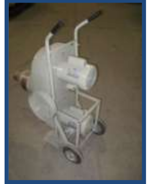
Kraemer Cart “D” (shown) Twin 1hp electric Cart “S” single motor