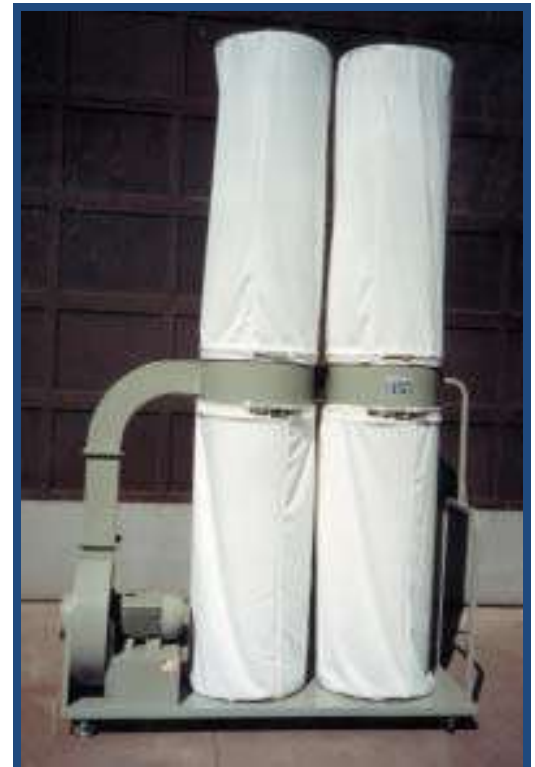
Kraemer S 52