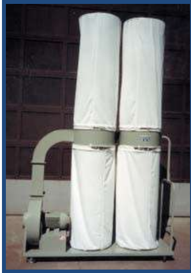
Kraemer S 22, S 32, S 52