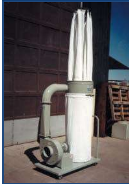
Kraemer S 2-6, S 3-6, S 5-6 For Mixed Dust

All units come complete with filter bags & clamps, switches. Silencers, multi-port inlet boxes are available as extra.