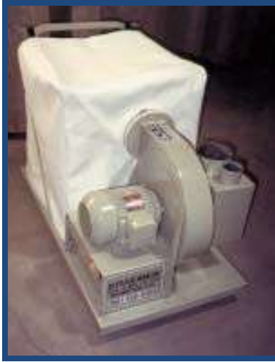
Kraemer S 2-L