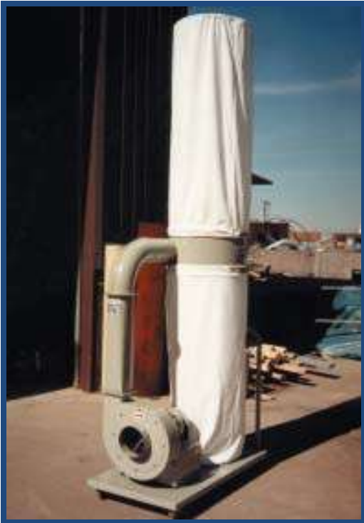
Kraemer S 2, S 3, S 5 For Coarse Dust