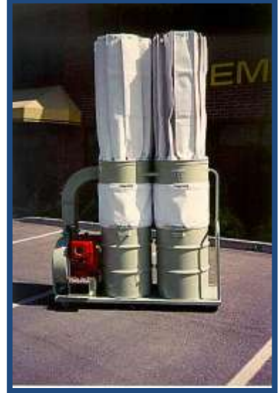
Kraemer S 52-12 GP (Gas Powered)