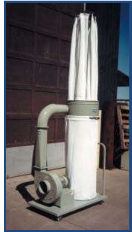
Kraemer S 2-6