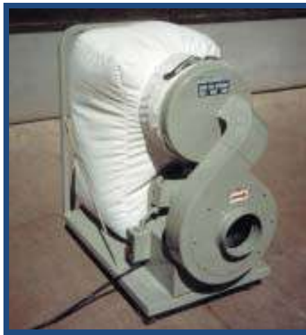
Kraemer S 1