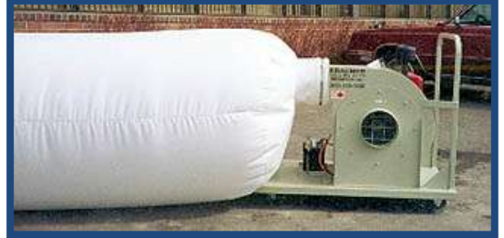
Kraemer Cart “L” Gas powered