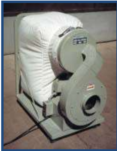
Kraemer S 1

KTM Portable Dust Collectors for fine, coarse & duct cleaning