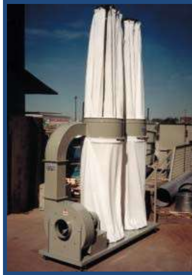
Kraemer S 22-12, S 32-12, S 52-12