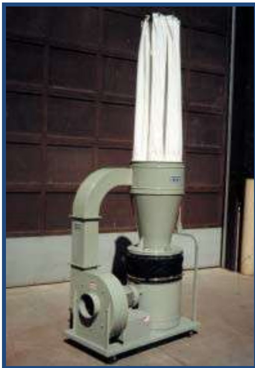
Kraemer S 2-6 CYN, S 3-6 CYN, S 5-6 CYN