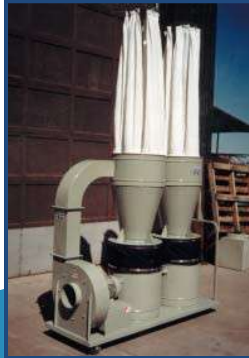
Kraemer S 22-12 CYN, S 32-12 CYN, S 52-12 CYN