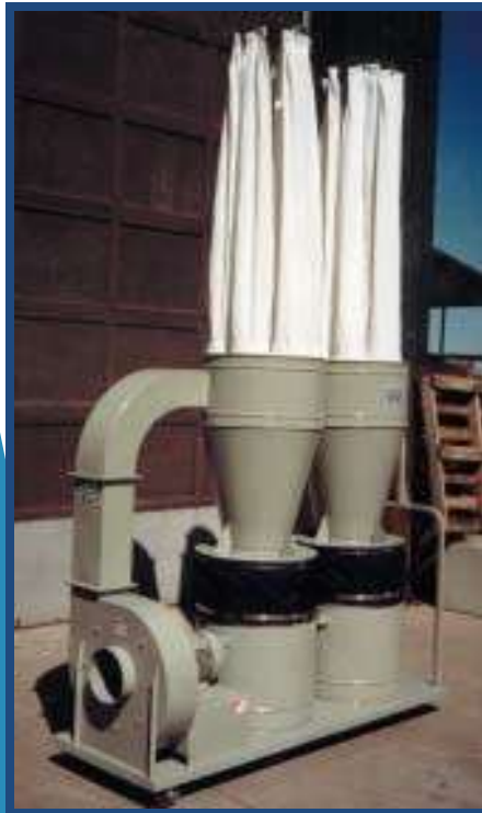
Kraemer S 52-12 CYN